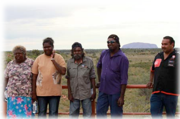
IPA Steering committee members at Uluru 2010

It is expected that the project will take 2- 3 years to complete before any formal declaration is made and agreements put in place with the Australian Government for longer term financial support to look after country for its significant natural and cultural values.