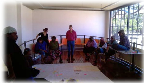
Kuju Wangka meeting held at Kaditj Café in late 2010

The Kuju Wangka committee, made up of representatives from the different native title holding groups, has sought funding for the drafting of a plan to guide management of the important values of the CSR. Management strategies will include development of a single permit system, the provision of culturally appropriate information in an array of forms, the construction of permanent and low impact campsites and the potential employment of indigenous rangers.