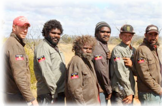
Members of the Birriliburu land management group

Birriliburu native title holders are employed to monitor the presence/absence of fauna using field data recording technology, performing water quality assessments and carrying out fire management services. In 2011 it is expected that the on country work will extend to developing a baiting program for introduced predators at the Carnarvon Range.