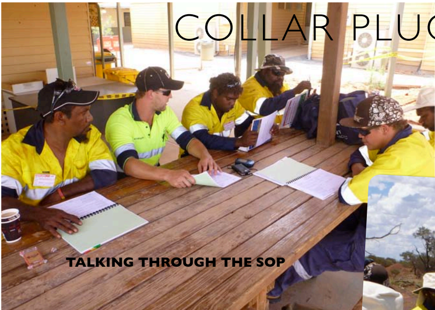
TALKING THROUGH THE SOP