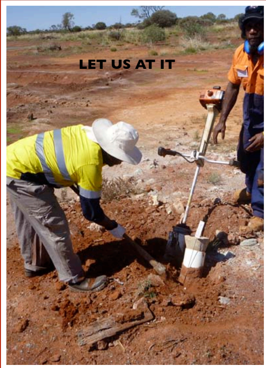
LET US AT IT